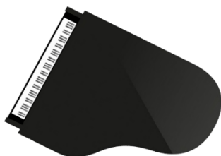
Piano fixed position for B grade, C grade & Novice. NO piano A grade