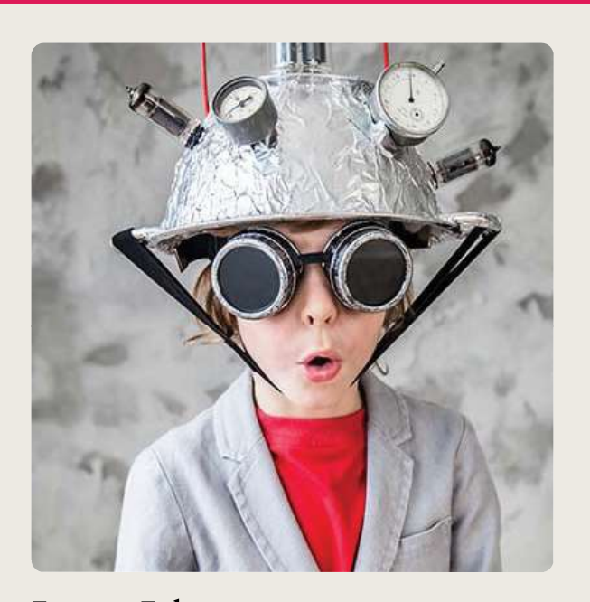
From 1 Feb